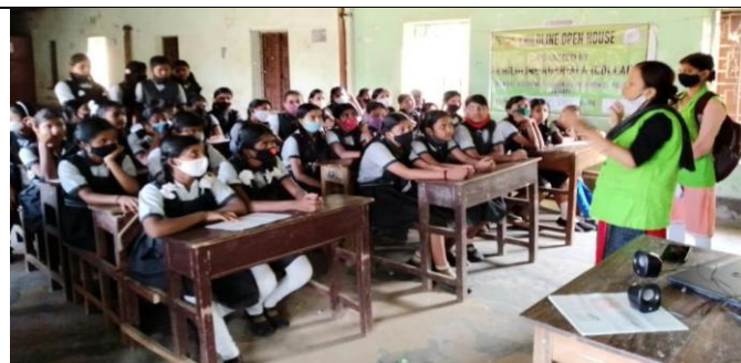
Open House programme at Badharghat H.S.School on 21/11/2021