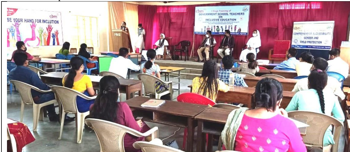
Teachres' Training on Inclusive Education and Capacity Building

♠ District level workshop on 5 years achievements of RAISE NE project: We organized this on 31 st May, 2021 in the office of School Inspector, Sadar A of West Tripura district. District Inspector of School –west Tripura District, District Coordinator -Samagra Sikha Abhijan, Arban-Coordinator (Sanagrasikha) and other staff of Samagra Shikha were present in this workshop.