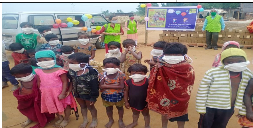
CHILDLINE SE DOSTI programme at Joy Maa Kali Brick field on 13/11/2021