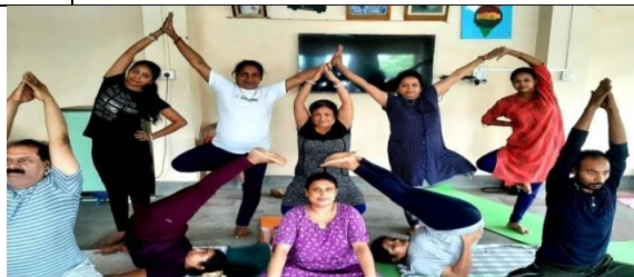
Yoga Teachers Training Class