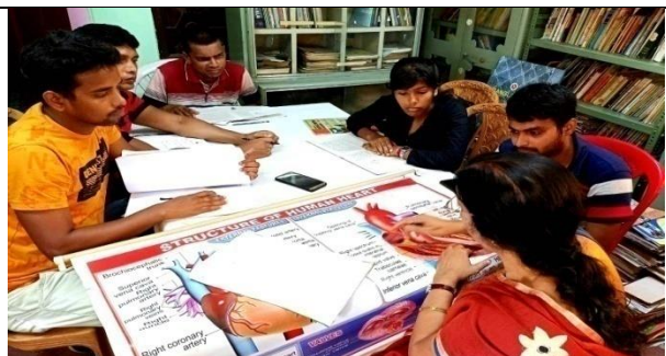
Class on Homeopathy Dispensing