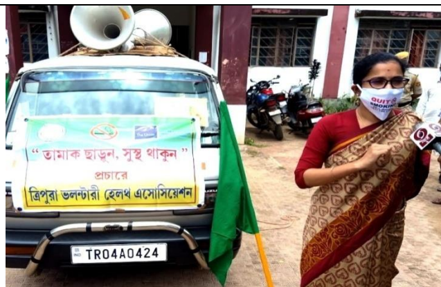
DM of Khowai delivering her message on WNTD