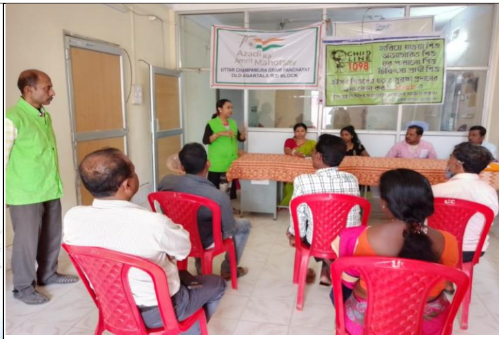
Panchayat meeting at Uttar Champamura Panchayat on 14/03/2022