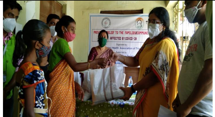
DM of Sepahujala district during distribution of dry ration to COVID effected family