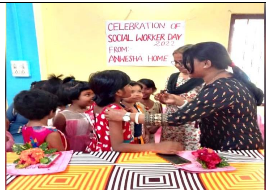
Celebration of Social Workers' Day