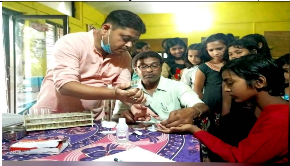
Periodical Haemoglobin percentage test of the children of Anwesha Home