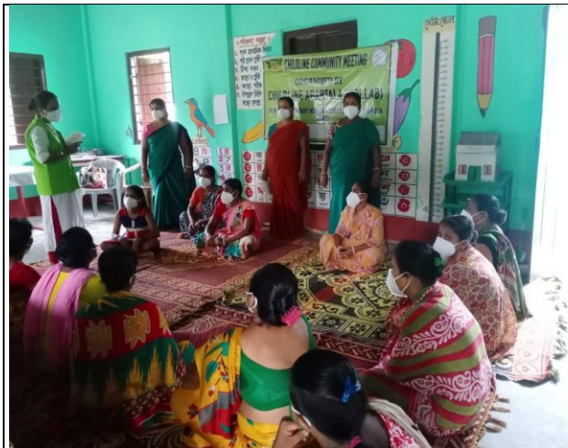
Community Meeting at Charipara ICDS Centre on 23/07/2021

children of brick field. On 14 th November CHILDLINE Agartala celebrated Children's Day at Anwesha Child Protection Centre. On this occasion the children participated in cultural activities, sit and draw competition and received prizes. A rally was organized by Team Members of CHILDLINE with posters and banners of CHILDLINE se Dosti. A drama was acted on Prevention of Child Marriage at Brajanagar School in Ranirbazar in collaboration with 'Dristipath' Social Organization which got lot of appreciation from crowd.