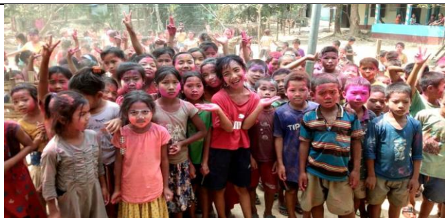
Celebration of Holi by hostel children