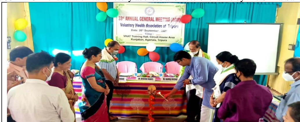
33 rd Annual General Meeting of Voluntary Health Association of Tripura