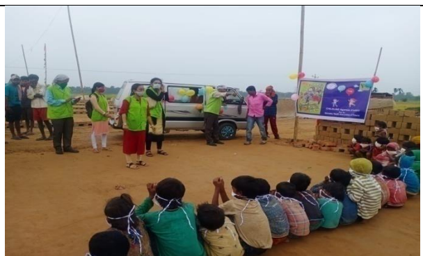
CHILDLINE SE DOSTI programme at Joy Maa Kali Brick field on 13/11/2021.