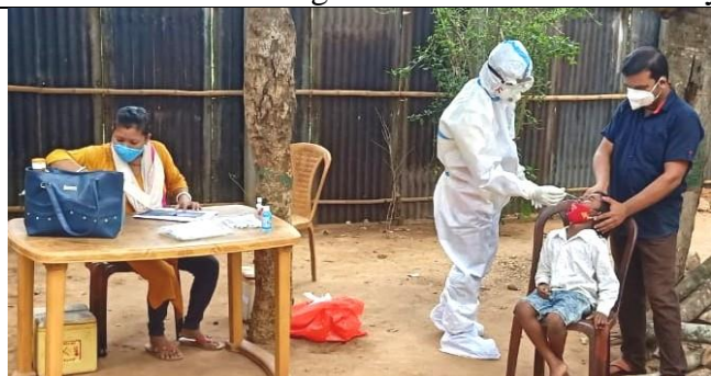
COVID testing (RT-PCR) of Children

This year, 23 children were exited from Unmesh Home: one to After Care Home in North Tripura District and 22 children were reintegrated to the families or extended families after the social investigation of the family situation and counseling of both children and family members.