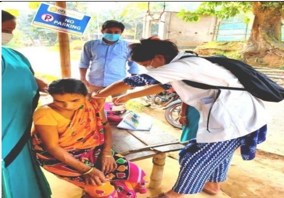
Vaccination under CAC-Vax Now Project