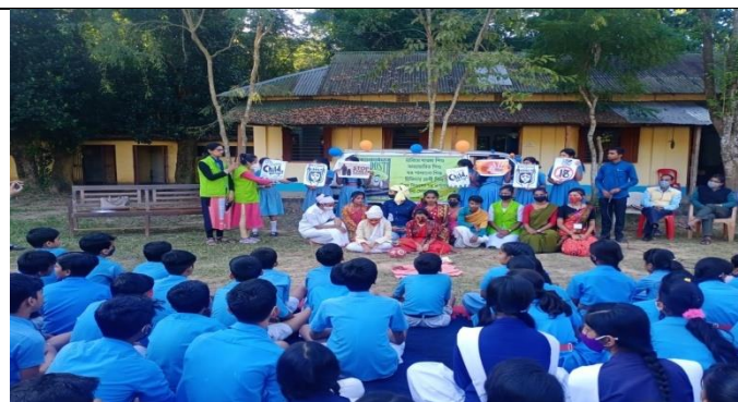
Street Drama about Child marriage at Brajanagar H.S. School on 18/11/2021