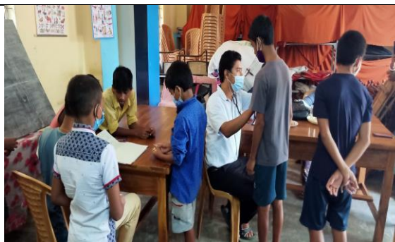
Health Check-up of the children by Medical Officer of Bishalgarh SDH

Children of Unmesh Home in a Group Counselling Session on COVID prevention