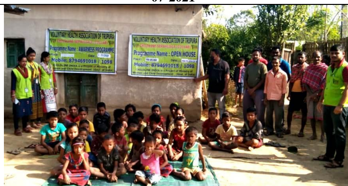
View of Open House Programme at Harishnagar G.P on 19-12-2021