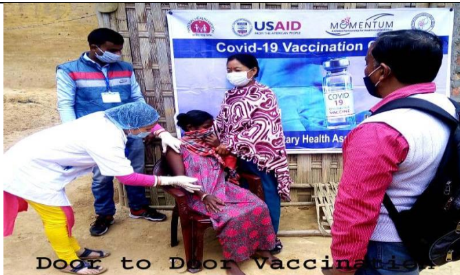
Door to Door Vaccination