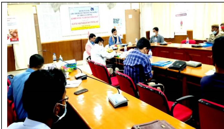
Training of Law Enforcers on COTPA 2003 in South Tripura