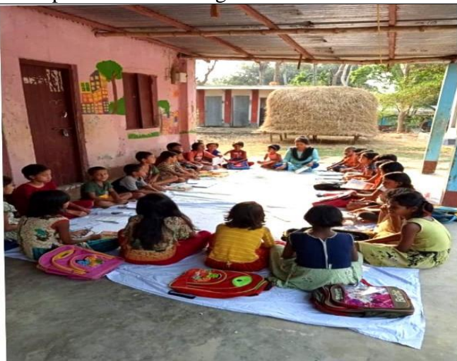
Discussion on Child Rights and Child Protection