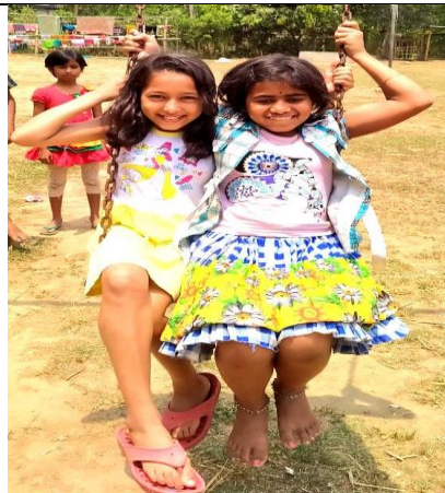
PLAY TIME IN ANWESHA HOME