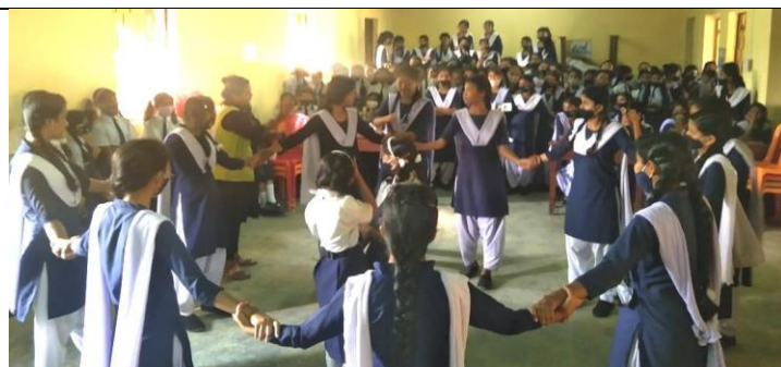
View of Awareness Programme at Kamranga tali H.S. school on 12-02-2022