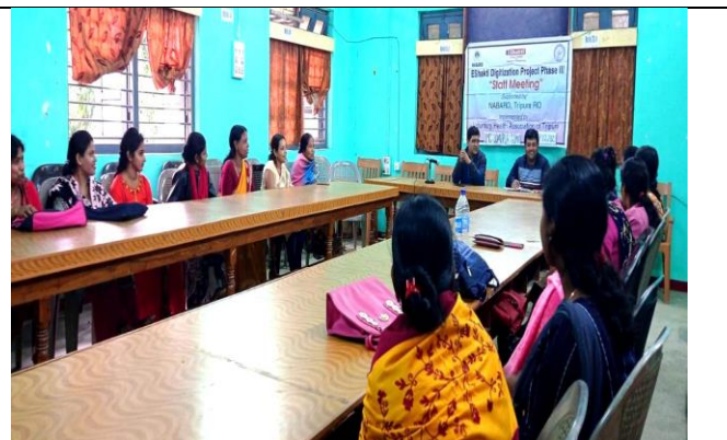
A Shakti Digitization Phase-III, Staff Training