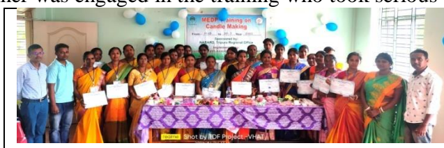
Participants of MEDP Training

To upgrade the skill of rural women on various livelihood activities NABARD has initiated Micro Entrepreneurship Development Programme. Apart from the skill development, the programme also has objective to build the basic entrepreneurship knowledge among the members of the Women Self Help Groups. Voluntary Health Association of Tripura (VHAT) has been working for the promotion of WSHG and building the skills on different job role. With support from NABARD, VHAT has conducted one MEDP training on Candle making at Tepania R.D Block under Gomati Tripura from 14 th to 30 th March 2022. Total 30 trainees were selected in consultation with block officials and training was conducted in the block premises. Resourceful trainer was engaged in the training who took serious effort to conduct the training session.