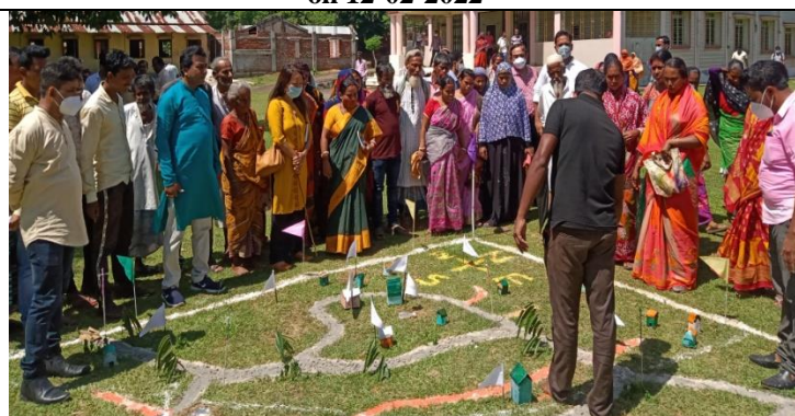
View of Participatory Rural Appraisal Exercise at Jampujala & Boxanagar R.D.Block