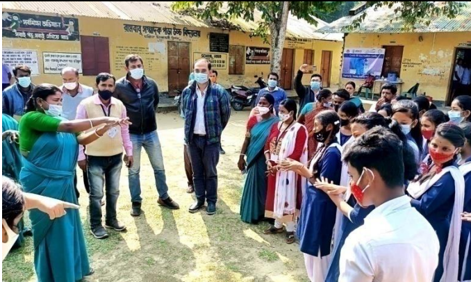
Awarness at school under M-RITE project