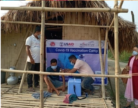
Vaccination in a rural area of Dhalai Dist under M-RITE Project