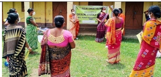
Relief distribution & community meeting at Vibeknagar on 20/07/2021