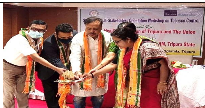
Inauguration of State Level Workshop in Hotel Parkline