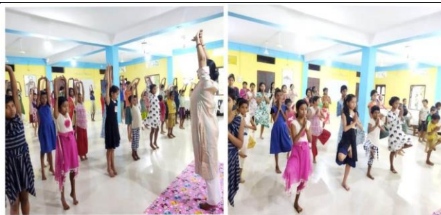
"International Yoga Day"