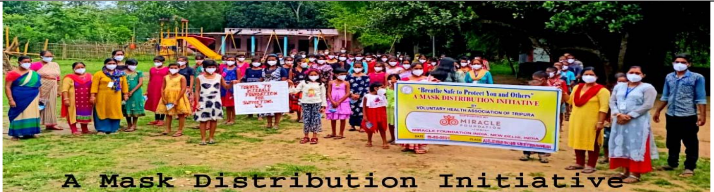
A Mask Distribution Initiative