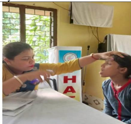
Health Check up in Anwesha Home

This year, with permission of CWC, 17 children from Anwesha Children Home, 10 children from Anwesha Open Shelter for Boys and 8 children from Anwesha Open Shelter for Girls were reintegrated to the families or extended families after the social investigation of the family situation and counseling of both children and family members.