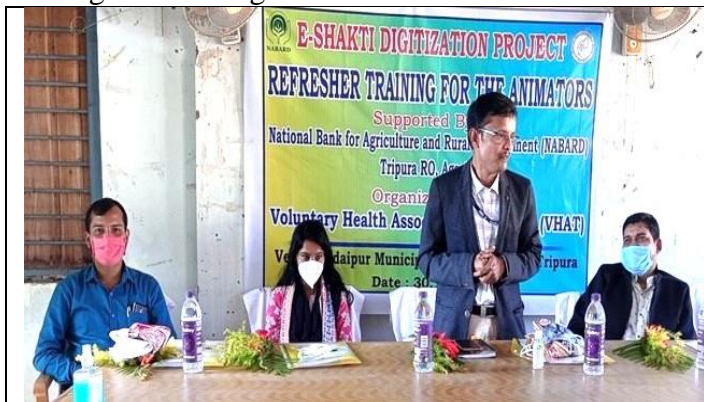
Training of Animators of A Shakti Digitization project