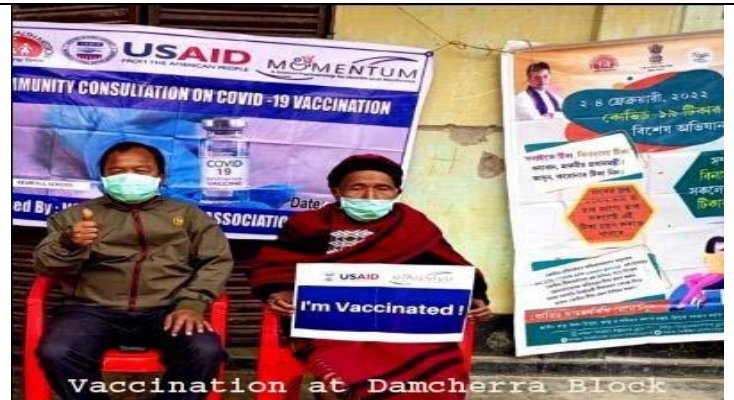
Vaccination at Damcherra Block