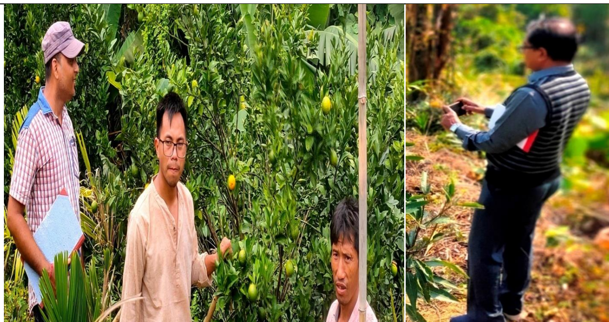
Officials of NABCONS on field visit