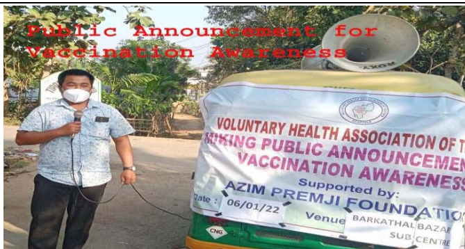
Public Announcement for Vaccination Awareness