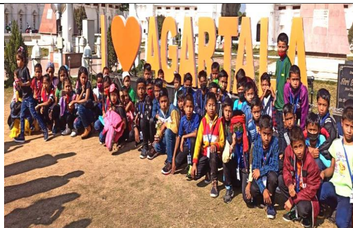
Educational Tour to State Capital-In front of Ujjayanta Palace