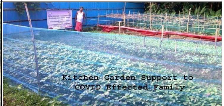
Kitchen Garden Support to COVID Affected Family