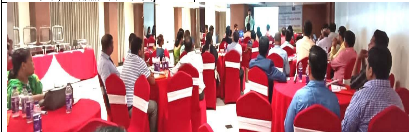
Participants of State Level Workshop

“The Journey of thousand miles starts with a single step .....take the first step to your goal by saying no to tobacco.”