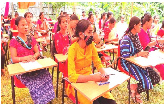
OFFICIAL INAURATION OF JSS DHALAI PROJECT

A total of 117 Aspirational districts have been identified by NITI Aayog based upon composite indicators from Health & Nutrition, Education, Agriculture & Water Resources, Financial Inclusion and Skill Development and Basic Infrastructure which have an impact on Human development Index.