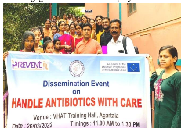
Dissemination Event on Handle Antibiotics with Care